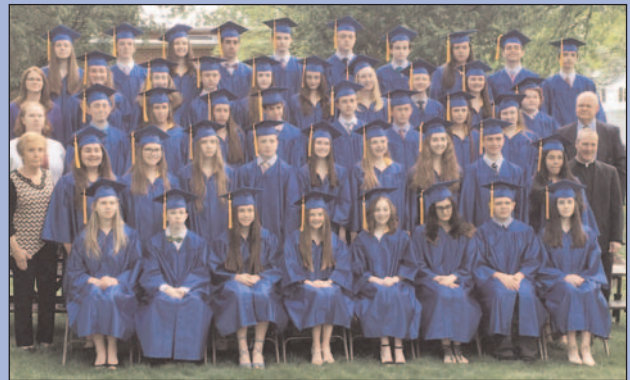
St. Rose of Lima Class of 2017