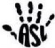
Sign Language Club